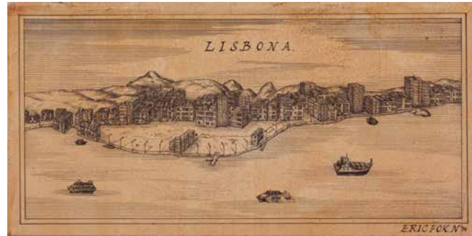
Paradise n° 83, 2014 Tinta da china sobre papel - 19 x 38 cm