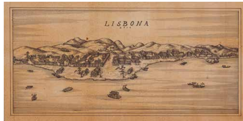
Paradise n° 63, 2014 Tinta da china sobre papel - 19 x 38 cm