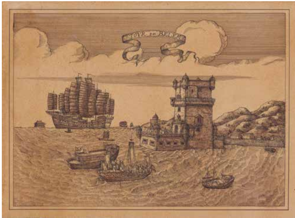
Paradise n° 80, 2014 Tinta da china sobre papel - 28 x 38 cm