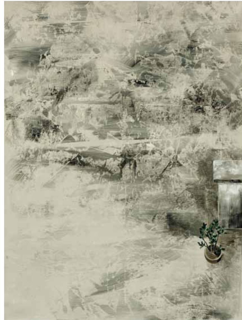
"The Flow of Time 2" , Oil on Canvas, 80 x 60 cm, 2012