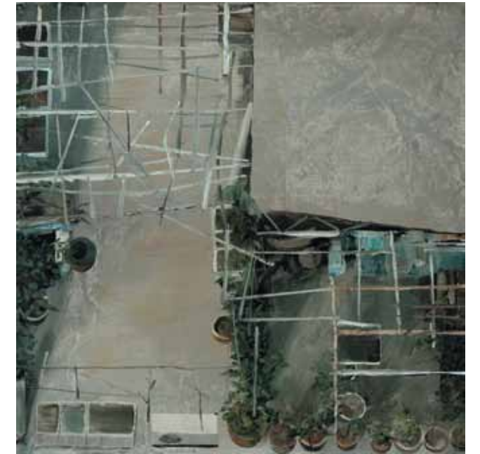
"Planting 12" , Oil on Canvas, 50 x 50 cm, 2013