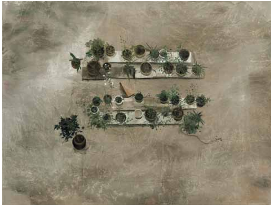
"Planting 10" , Oil on Canvas, 90 x 120 cm, 2013