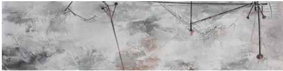
“The Delight of Life 6, Oil on Canvas, 32 x 125 cm, 2012