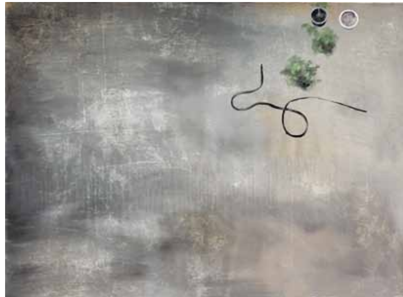
"Just Put Them Aside" , Oil on Canvas, 70 x 95 cm, 2012