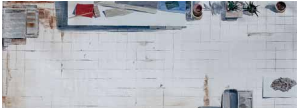
“Odds and Ends 3”, Oil on Canvas, 40 x 108 cm, 2012